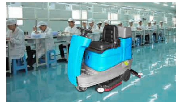
• 车间 / Workshop