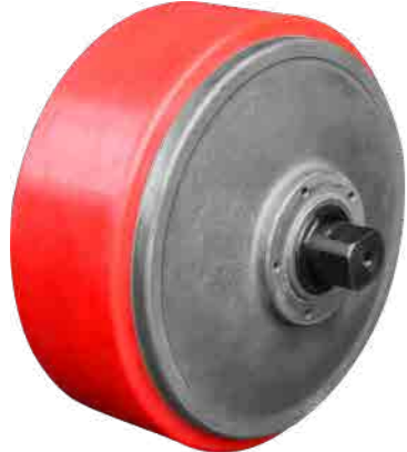
175LW001型无刷直流力矩电动机 Model 175LW001 brushless dc torque motor