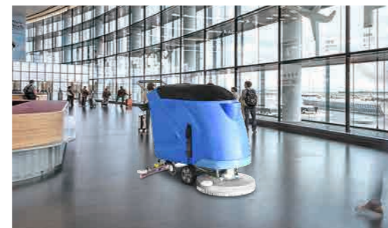
• 机场 / Airport