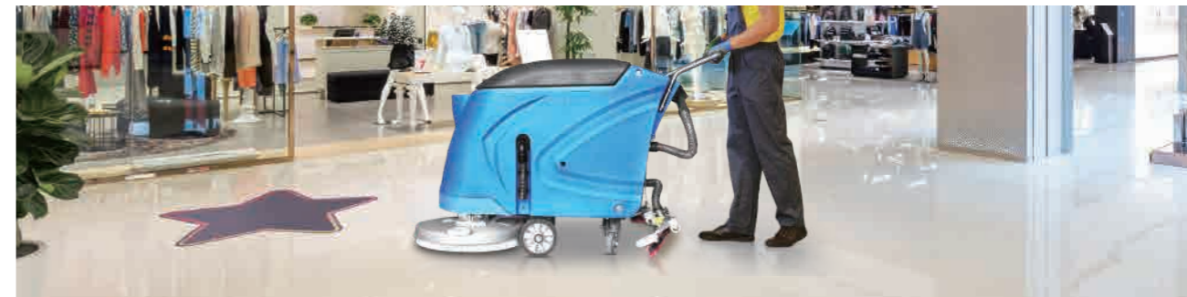
• 大型商场 / The mall

产品采用真空电机内置设计，采用更优化的消音方式，作业噪音仅58分贝，更安静，更舒适。 The product adopts vacuum motor built-in design, operating noise is only 58 decibels, more quiet, more comfortable.