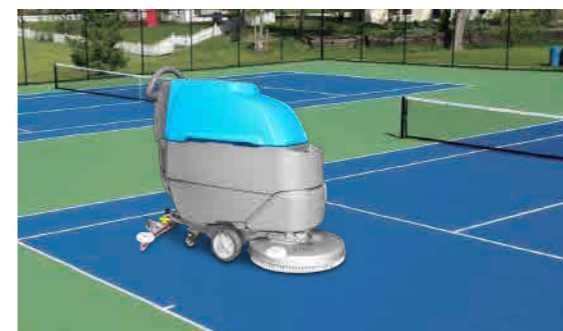
• 网球场 / Tennis court