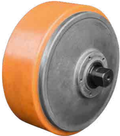
110LW001-Z1型无刷直流减速力矩电动机 110LW001-Z1 type brushless DC deceleration torque motor