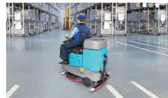
• 仓库 / Warehouse